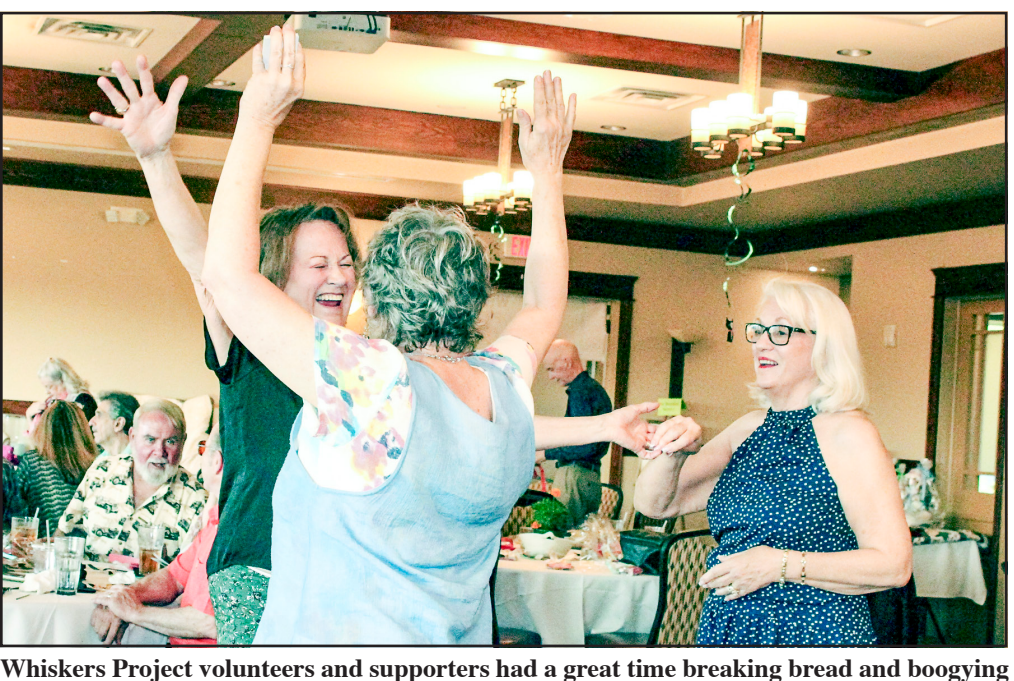
down inside the Community Center for their recent anniversary.