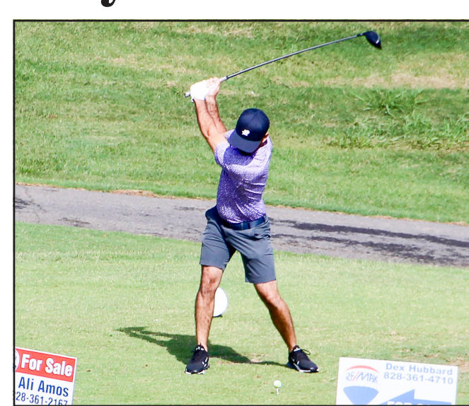
American Legion Post 121 and Auxiliary signed up 88 patriotic golfers to assist in their fundraiser tournament last

The top Men's and Women's teams were awarded cash prizes, with gift baskets provided by local shops to the players who had the "Longest Drive" and were "Closest to See Putting with Patriots, Page 2A