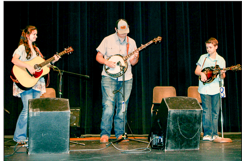
For many families, bluegrass is a way of life, and judging by the turnout of participants for the return of the Georgia State Fiddlers Convention to North Georgia, the Appalachian tradition is here to stay.

held, he had the opportunity to heard – backstage. play at the Grand Ole Opry in Nashville.